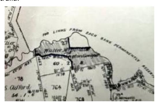
Sanctuary, Mt Evelyn, National Fitness Camp

Less than three months later, in April 1951, St Mark's Holiday Home was sold to the Lands Department to be run as the first permanent national fitness camp in Australia. <sup>15</sup>