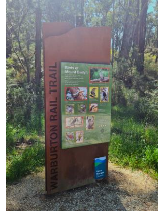
'Birds of Mt Evelyn'.

The other three signs on the Trail are: at the Woori Yallock Creek bridge, just east of the Healesville-Koo Wee Rup Road, and beside Hoddles Creek at Launching Place.