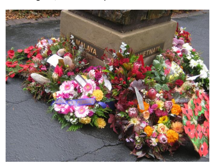
War Memorial with tributes. Ours is the red bunch on the corner.