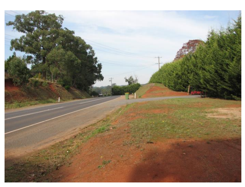
Monbulk Road Mt Evelyn cuts through a hilltop that might have been an Older Volcanics crater.