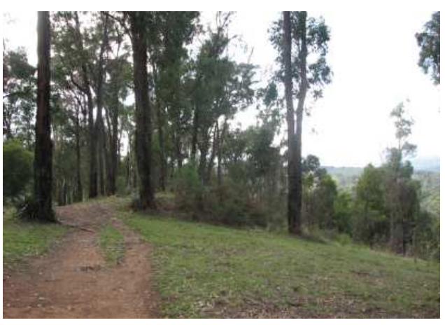
Wilkilla Track, route of a 1850s timber tramway to the Olinda Creek saw mills and one of the tracks to Harmony Vale.