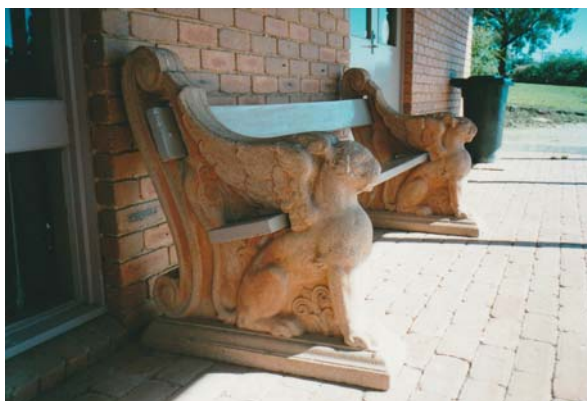
Above, Mt Evelyn's last surviving winged lion seat when it was in storage at the Shire depot.

You might like to purchase a seat for your private use, or sponsor a seat to be erected in a public place such as along the Warburton Trail or the Aqueduct Walk. If so, please let Paula know.