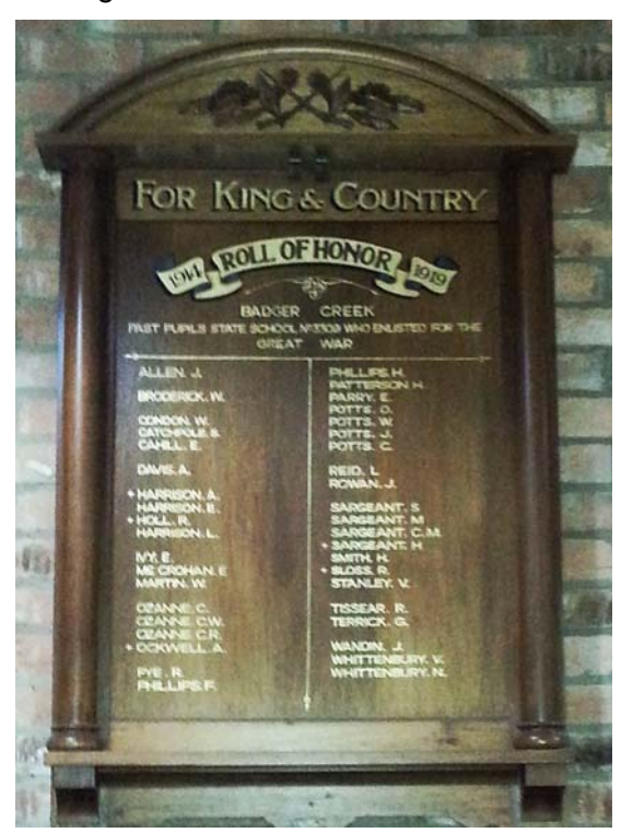
Above, Badger Creek School World War I Honour Board. At least five of those listed were Aboriginal men from Coranderrk.