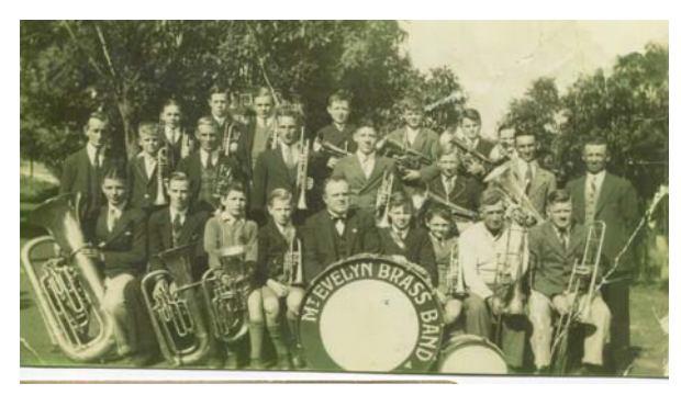
Above, the Mt Evelyn Brass Band, ANZAC Day 1937, Avenue of Honour.

There was lots of native life around Mt Evelyn: wallabies, wombats, echidnas. As a child George knew where all the birds and possum nests were and went rabbiting. There were 30 foot high cypresses next to Grantully Guest-