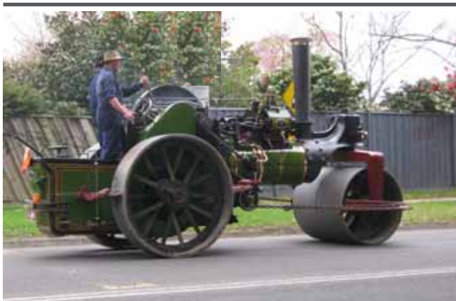
It just keeps rollin' along... This beautifully restored steam roller was spotted in Hereford Road on 15 September on its way to the Healesville Railway Heritage Festival.

'In our words' digital stories The Virtual Museum also hosts the 'In our words' digital stories, recorded with Victorian veterans over the past two years. They include personal accounts of war and repatriation by World War II, Korean War and Vietnam War veterans, which make compelling viewing. This project is still underway in partnership with the Shrine