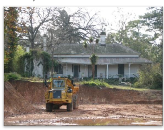
Decaying beauty: derelict house below the Rail Trail, Maroondah Highway, Lilydale.

Funding for the trail bridge has been announced repeatedly but this is the first sign of action. Did somebody mutter 'election year'?