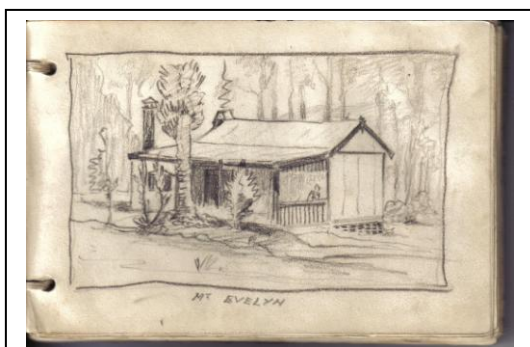
'Mt Evelyn' by Norman Valentine Haines.

Two of the drawings displayed were definitely of Mt Evelyn, including a sketch of the former Post Office on the Snowball Avenue/ Birmingham Road corner. Norman's drawings of farm machinery, though not specifically labelled as Mt Evelyn scenes, fitted in well with a painting of the old shed at Westhill by Esmond New and a sketch of the same shed by Trevor Opray.