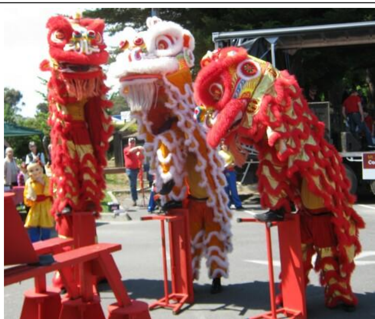
In conference: the Lions rear up and get their heads together. The little girl clown at left stirs them up if they look sleepy.

One series never shown in public before was a group of sketches by Norman Valentine Haines, Vicky