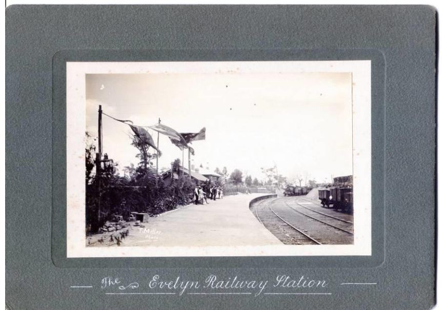
Evelyn Railway Station 1911.