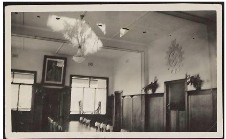
'Australian Nazi Party room, Dandenong Ranges', 1939.

We can add another site, 'The Brown House' in Belgrave, also known as the Nazi Club and the German Club. Opened in 1938, the Brown House took its name from Hitler's headquarters in Munich. Despite protests from various quarters, the club was allowed to operate until the outbreak of war in 1939. It was then closed down and the property confiscated as a prize of war by the Department of Defence. Several members of the club were interned. Most were released but at least one was confined to the Tatura Internment Camp for the duration of the war.