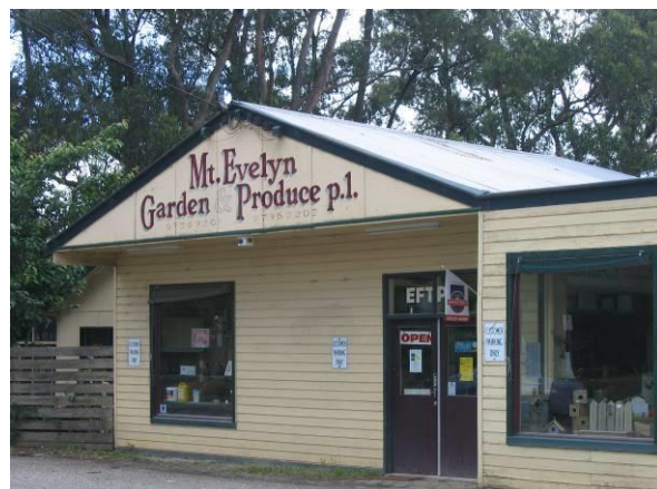
The Produce Store.