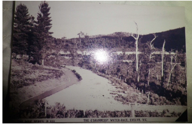
Above left, 'O'Shannassy Aqueduct Mt Evelyn Vic', Above right, 'The O'Shannassy Water-Race, Evelyn'

photo was taken from near Swansea Road, looking up the hill towards Westhill. Remnants of the permanent iron pipe can still be found in the ground along the pipeline easement.