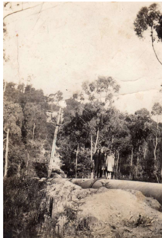
Above left, 'Mt Evelyn Old Channel Water Carriageway'. Above right, 'Temporary Pipeline in Mt Evelyn'.