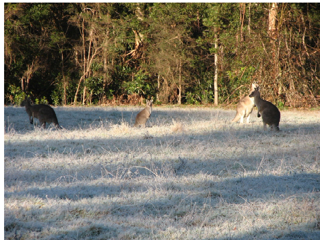
A mob of roos enjoying the morning sun near Olinda Creek, 19 July 2015. Temperature -2°C.