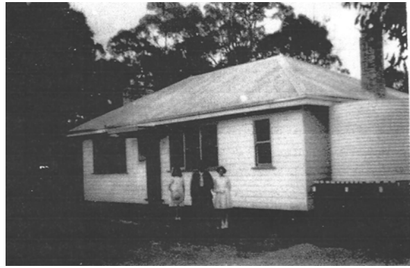
Above, the Freemans' home Oriel House when completed, 1950s.

tank stand, Dad had set up a cold water shower area and a primitive laundry. Everything worked well for us and we thought we had a palace.