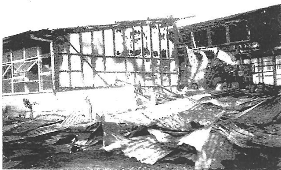
Above, Lilydale High School after the fire, 1957.

During my years in Mt Evelyn I started attending the Church of England and later became the instigator and leader of the Girls Friendly Society (GFS). At the same time the Church of England Boys Society (CEBS) commenced and the youth work flourished for