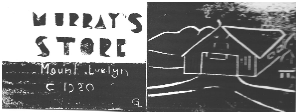
Thanks to Greg Luke for this delightful card showing the original store in Wray Crescent.