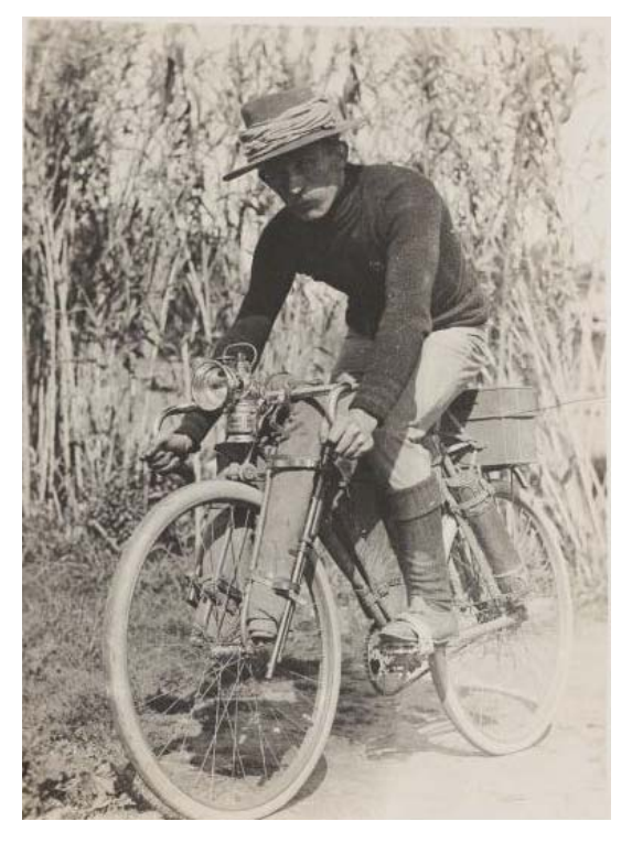
Above, Francis Birtles on his bicycle.

Birtles wrote a number of books on his adventures: Lonely Lands: Through the Heart of Australia, 1909; 3,500 miles across Australia in a Ford car, 1913; Darwin to Adelaide: Francis Birtles' history making journey, 1924 and Battle Fronts of the Outback, 1935.