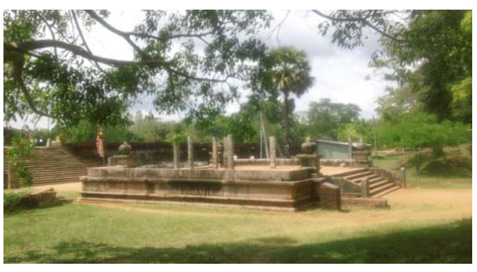
Above, monastery ruins, Anuradhapura.

Next day we began our bicycle tour of the ruins of ancient Anuradhapura at a sacred Bo-Tree. This tree is believed to have been planted in 245 BC from a cutting of the original tree in Bodhgaya under which the Buddha gained enlightenment. It is protected by descendants of the original tenders of the cutting, who are dressed in white to make their role clear to visitors.