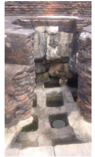
Below, Kantaka Cetiya stupa; above, interior of a ruined stupa at Anuradhapura.

At the foot of the mountain are the ruins of a hospital and the remains of its medicinal garden. Between the hospital and the steps leading to the peak are the ruins of a large monastery.