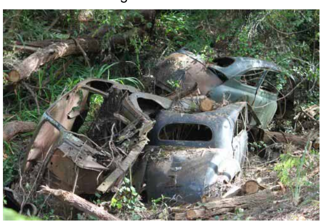
Relics of the Fabulous Fifties rusting on the Water Race Trail prior to removal.

'At 12.45 pm today [21 March] the Borang Avenue cars disappeared on the back of Steve's truck', Ben emailed triumphantly. 'Total removal and loading time was 3½ hours... We had a couple of old Fiats, a Morris Minor and a Standard Vanguard. All gone now. All we need to do now is plant a few small shrubs and/or erect a sign to prevent it being filled up with rubbish again!'