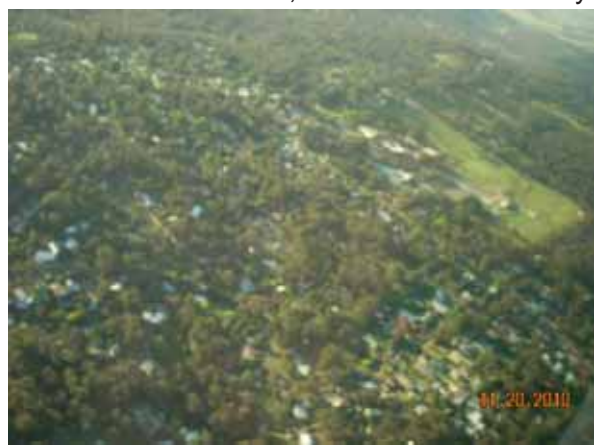
The Billygoat Hill area today, Morrisons Reserve at rear, right.