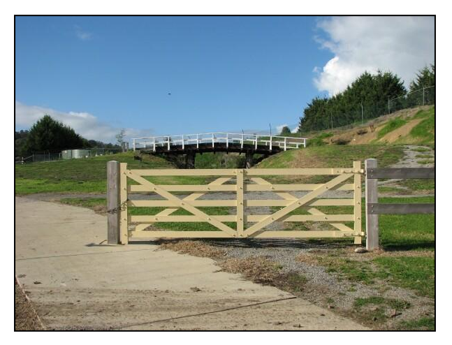
The restored Nelson Road Bridge, Lilydale, with reconstructed railway gate.

Did you know that the old Nelson Road bridge over the Lilydale to Warburton railway line (Melway 38 G2) is now accessible to Trail users? For years it was shut away behind cyclone mesh in the grounds of Mt Lilydale College and was filled in underneath for safety.