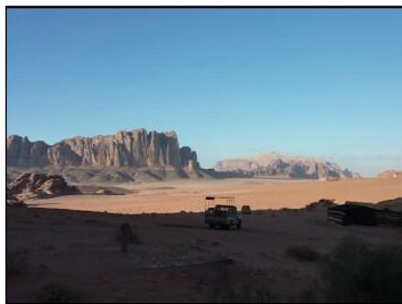
The otherworldly landscape of Wadi Rum

On our first full day in Jordan we visited the World Heritage area of Wadi Rum for a 4WD desert safari driven by the local Bedouin. Many movies have been filmed in Wadi Rum, notably Lawrence of Arabia , since this is the actual area in which Lawrence lived and fought. It has also been used for the surface of Mars.