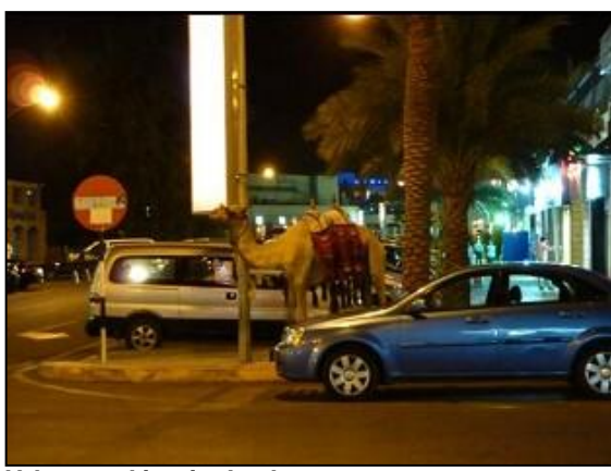
Urban parking in Jordan

Jordan on the other hand is a poor country with few resources beyond tourism – no oil, no wealth, and its water being taken by Israel. Yet it appears to be very well organised and very well run. There are traffic rules and people follow them. That includes the highly prized horses and camels being used in the towns as well as cars, and sheep flocks being walked through towns.