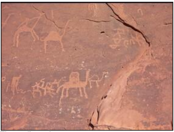
Thamudic rock art

Sights included many areas connected with the Lawrence saga, as well as fascinating pre-Arabic Thamudic Rock paintings. We ate and slept that night with the Bedouin group, either in the tents or under the stars. Tim and I chose the tents, as it was very cold, and we slept in sleeping bags, dressed in hats and gloves. The black tents are made from woven goat wool and, though you can see through them, a bit like shade-cloth, they keep out the cold and wind very effectively.