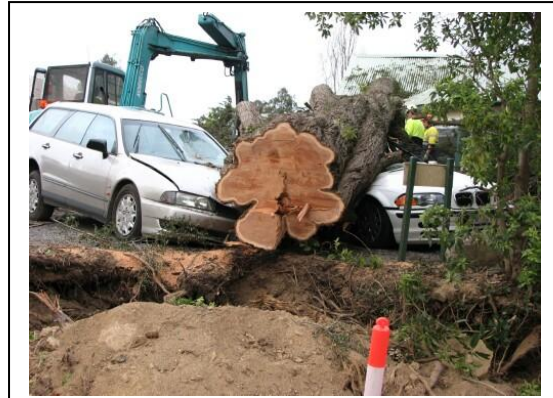
Not going anywhere: cars flattened by a huge cypress at Morrison House.