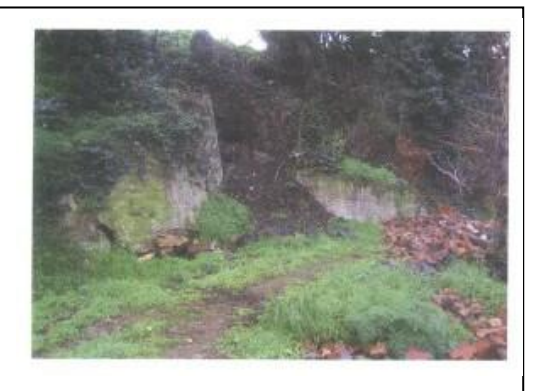
The excavation site at Westgarth. The bricks were cleared from the tunnel, where they had been used as fill.

Mark is motivated by his interest in history and archaeology, but also by concern at what the wartime tunnels and bunkers may contain. If chemical or radioactive material is stored underground, it could eventually leach into the ground water, with disastrous consequences for the environment. There are also possible health hazards for residents. Cancer 'clusters' appear to be a recent phenomenon that may be associated with radioactive material stored nearby.