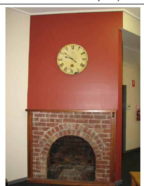
The Stationmaster's fireplace.

One feature that remains is the chimney, most easily seen from the Memorial Kinder car park on the other side of the Trail. In the recent refurbishment of the Community Room, the old brick fireplace has been uncovered (or one of the fireplaces – there was probably another in the corner of the Exhibition Space).